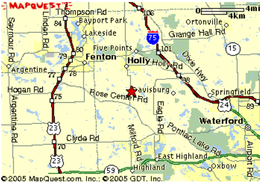
© 2005 MapQuest.com, Inc.: © 2005 GDT, Inc.