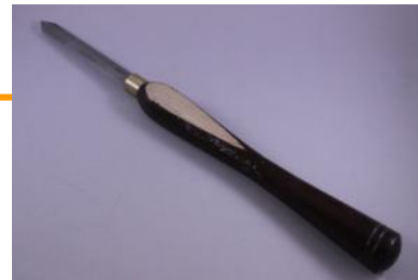
Making a flat spot on the tool handle will stop the tool from rolling off of the lathe bed or work table.