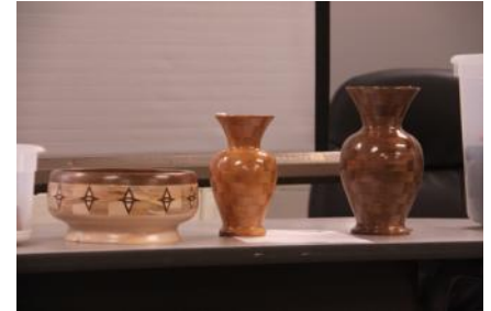
Some of Gary Smiths Segmented turnings.

Parking is in back and the entrance is thru the side door that you drove past. Be careful not to let the cats out.